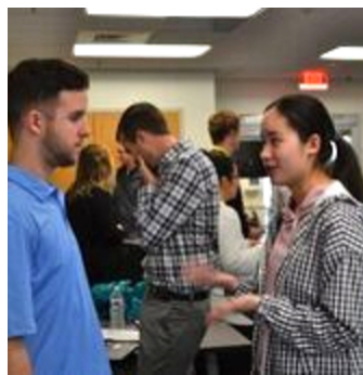
Students practiced their "elevator" speech